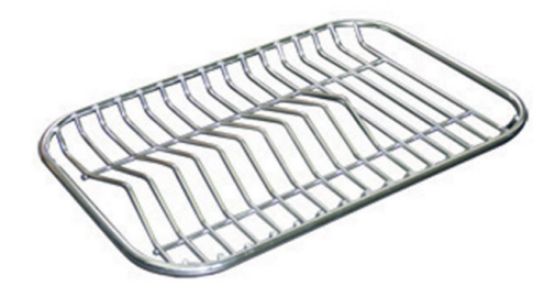
Stainless steel plate rack 8100 280