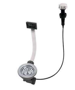
Automatic waste fitting 8407 100